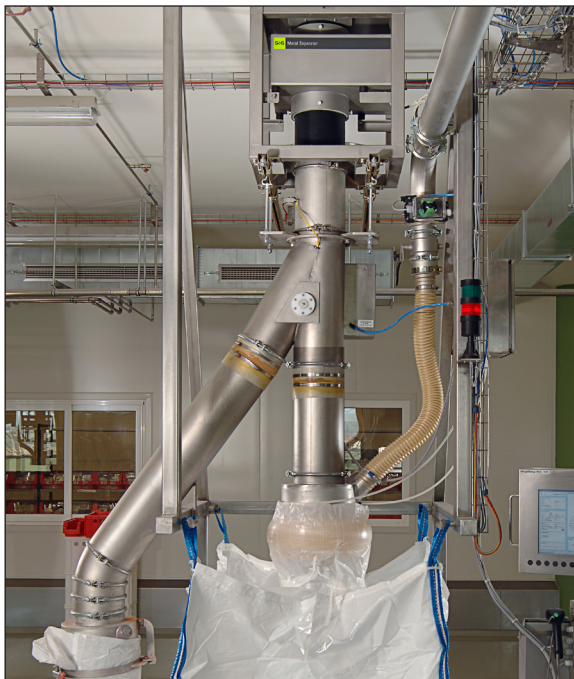
Installation example: IFS compliant metal detection directly before the filling of spice products into bigbags. (old version)